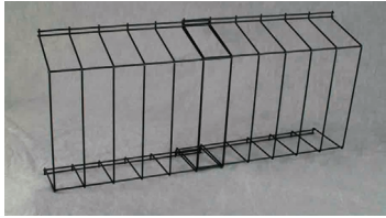
WG-3 WIRE GUARD