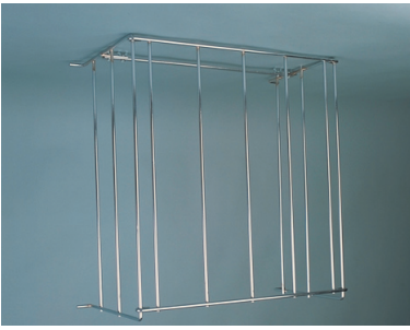
38-6 WIRE GUARD