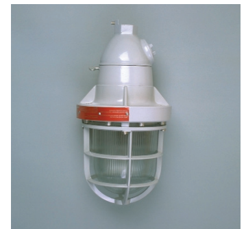
PENDANT MOUNT (-P)