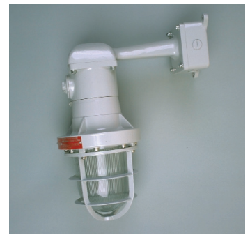
WALL MOUNT (-W)