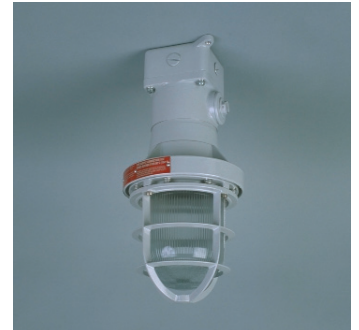
CEILING MOUNT (-C)